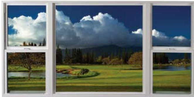
Common Frame Picture window with single hung flankers