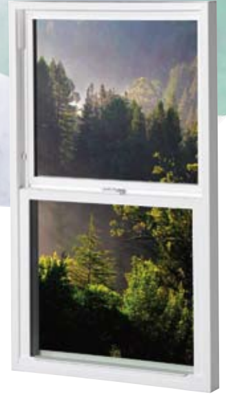
Single hung window