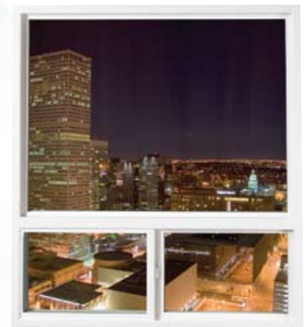
Common Frame Picture window with under slider