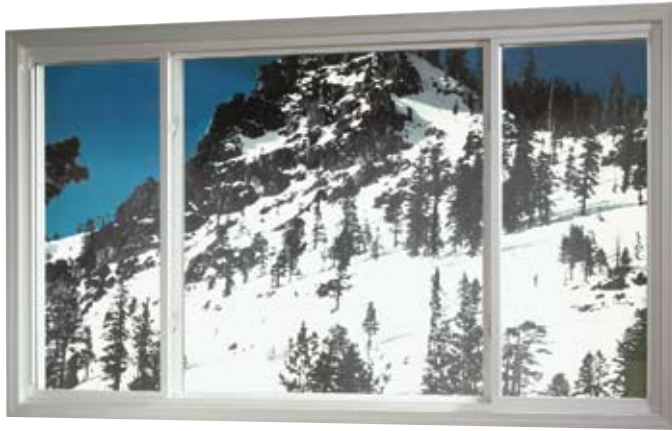
Three lite slider

No matter what kind of opening, or style of home you have, the energy saving Craftsman Portrait Series from Amerimax has a window that will be the perfect fit.