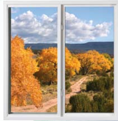
Two lite slider