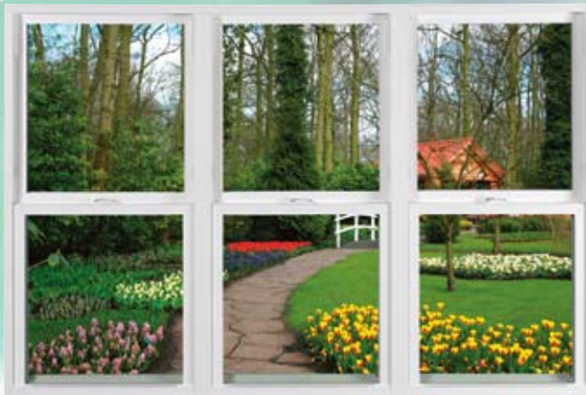
Common Frame Triple single hung window